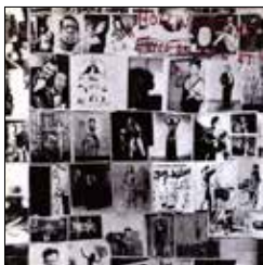
Sweet Black Angel, The Rolling Stones (M. Jagger/K. Richards) (1972)

Got a sweet black angel, Got a pin up girl. Got a sweet black angel, Up upon my wall.