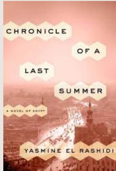
Chronicle of a Last Summer: A Novel of Egypt Yasmine El Rashidi (2016)